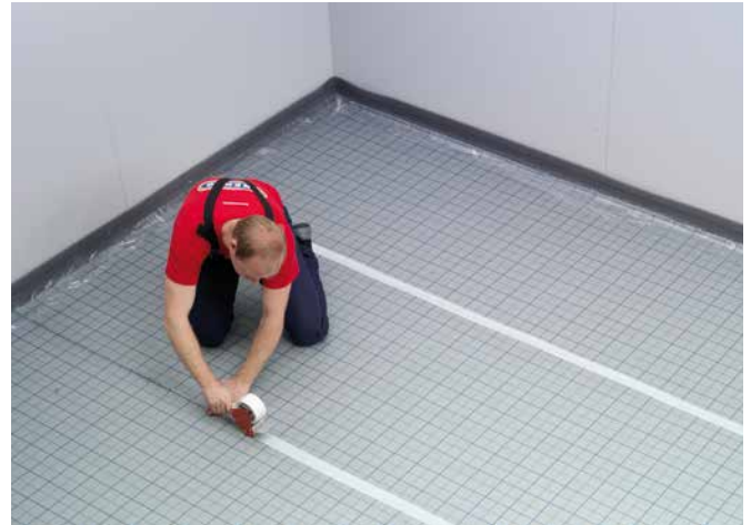
The overlapping flaps should preferably be taped over.