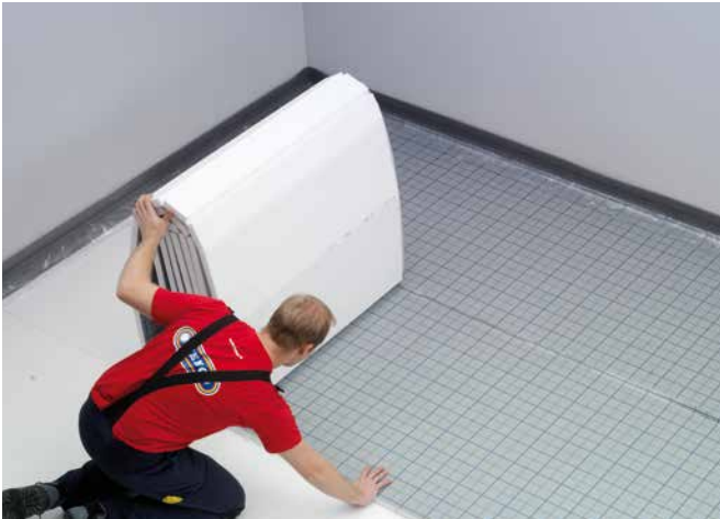
The insulation by roll is applied to a flat and clean substrate.